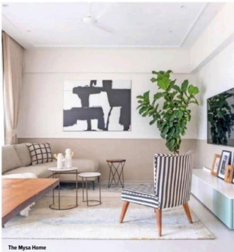
The Mysa Home

Disha: In the new normal, functionality has become a key to designing spaces. In fact, multifunctionality has become imperative today. With the pandemic,