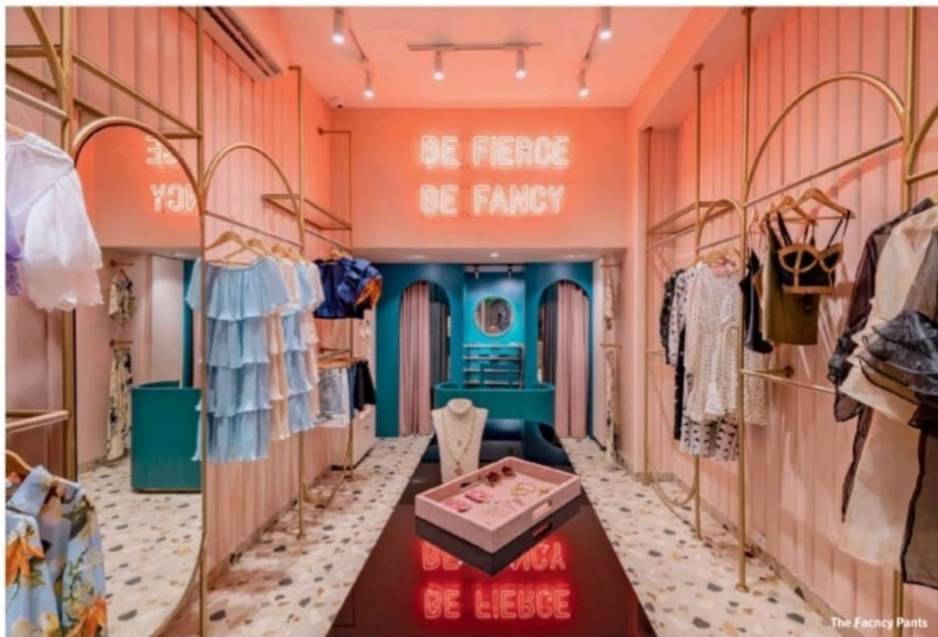
The Fancys Pants

AS A PRACTICE AND AS A STUDIO, WE STEER CLEAR FROM 'TRENDS' AND ANY SORT OF BADGE OR TITLE IN GENERAL. WE ADHERE TO OUR AUTHENTIC DESIGN SENSIBILITIES, THE CLIENT'S PERSONALITY AND THE NARRATIVE THAT THE SITE DEMANDS."