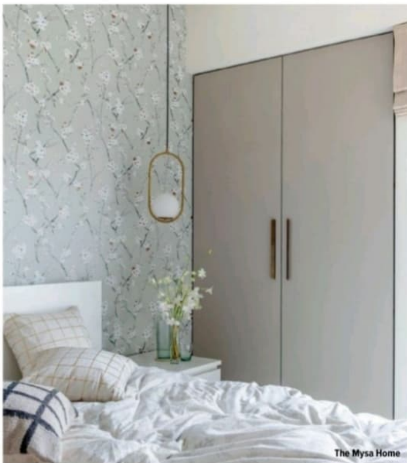
The Mysa Home