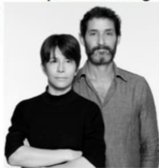
90 Materials Nature & Textures - Studio Vayehs