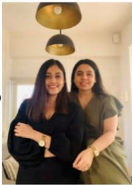
50 Minimalism - Quirk Studio