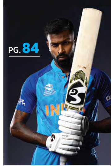
Hardik Pandya led Gujarat Titans to their first IPL title